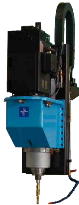
DS servo spindle

From DS-050 to DS-080, drilling capacity from Ø6 ~ Ø80 mm (Max. Ø100 mm). Standard BT shank designed for tools quick change by one touch and automatic tool change.