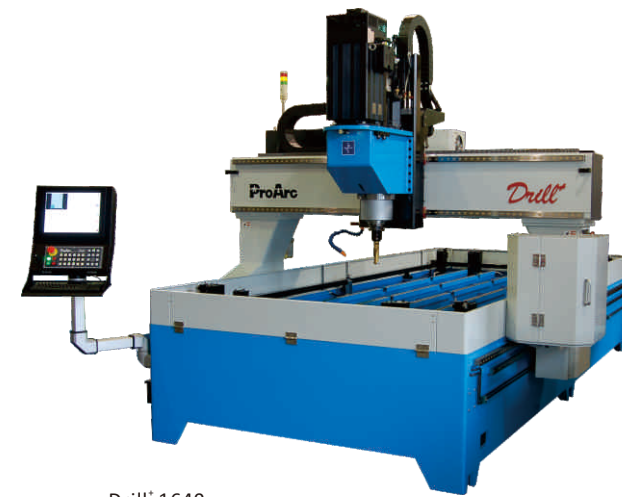
Drill + 1640