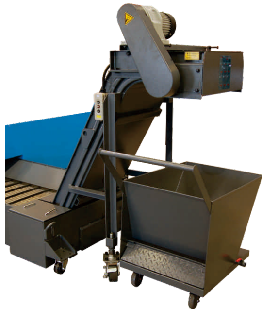
Electric chip conveyor with chip bucket